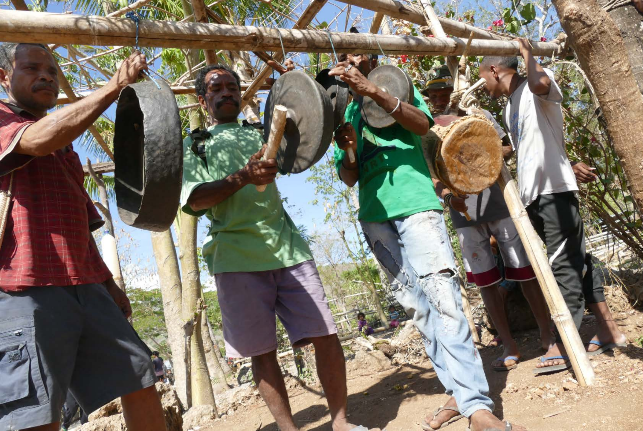
Anartutu, diktama gong drum ensemble, nov 2019