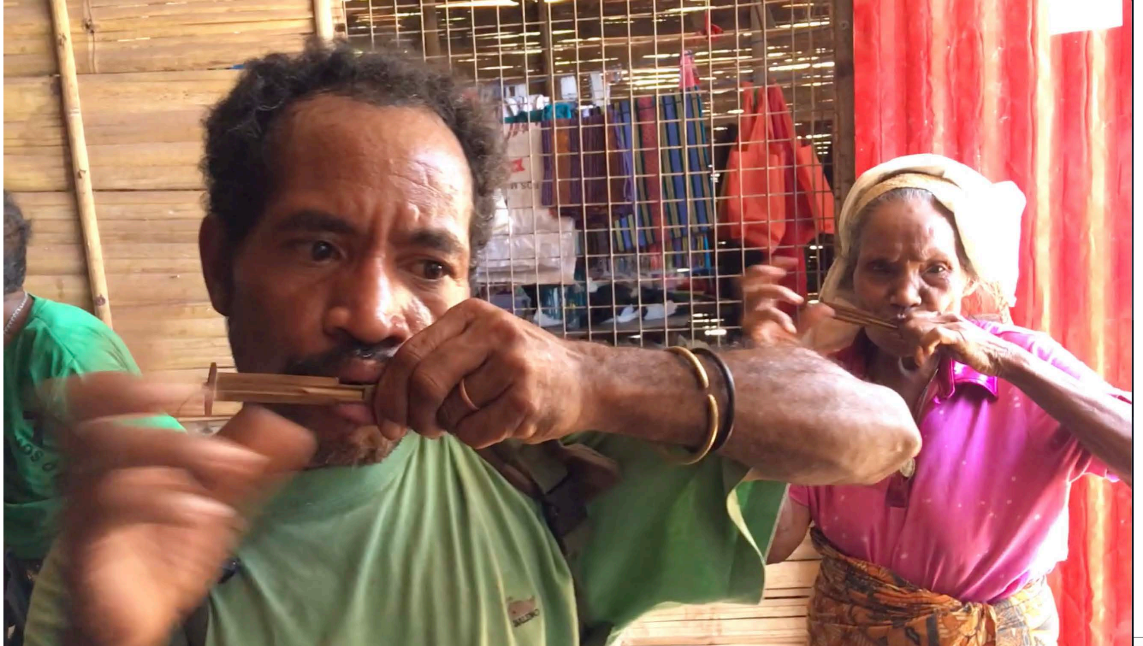
Makadadé, jew's harp ( aklamu )